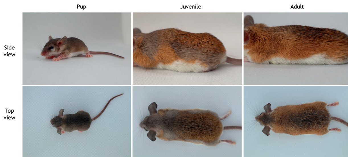
Fig. 2. Hair colour and development in Acomys . Images of the hair colour at three stages of development of Acomys cahirinus viewed from the side (top row) and from above (bottom row). Pups (left column) are born with grey hairs; the golden spiny hairs first begin to appear on the caudal dorsum as sexual maturity approaches (middle column), spreading completely over the dorsum by adulthood (right column). See Jiang et al. (2019) for details on different hair types and their development.

Although spiny mice have recently come to prominence because of their striking ability to regenerate several organs and tissues, as described below, they have been used as research animals and kept in breeding colonies since at least 1911 (Bonhote, 1911). Indeed, it is surprising that their regenerative abilities had not been observed before 2012 (Seifert et al., 2012). Previous research using spiny mice